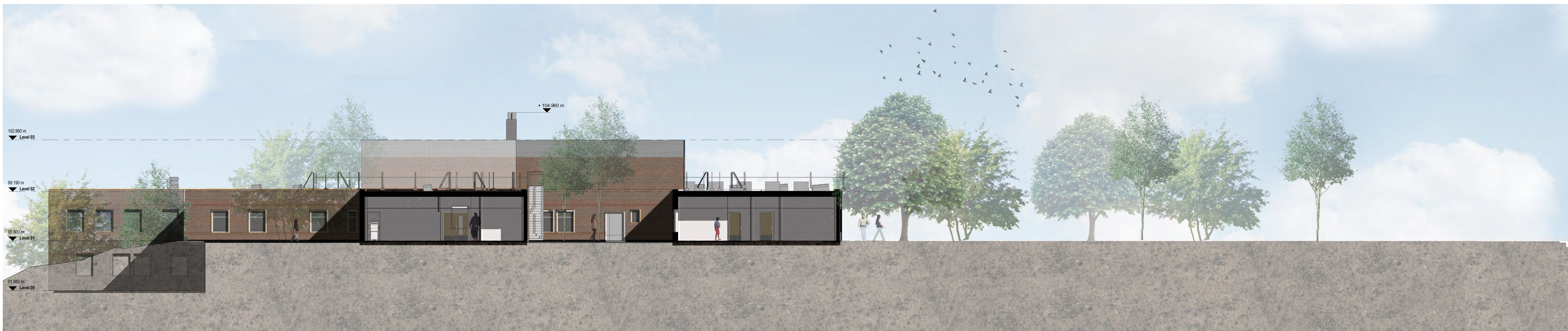
Section 2 - Cross Section