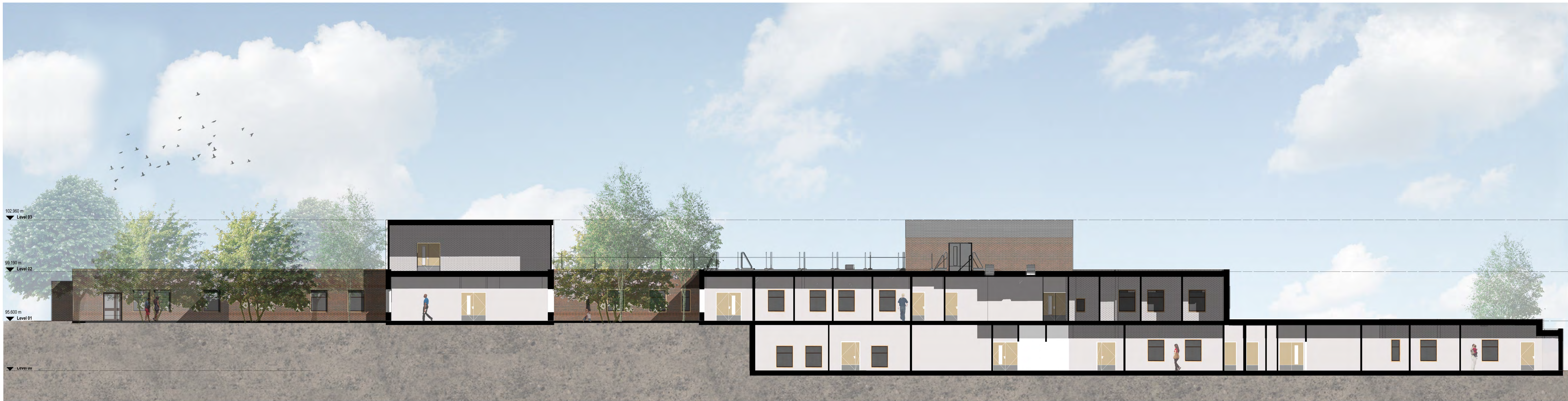
Section 1 - Long Section