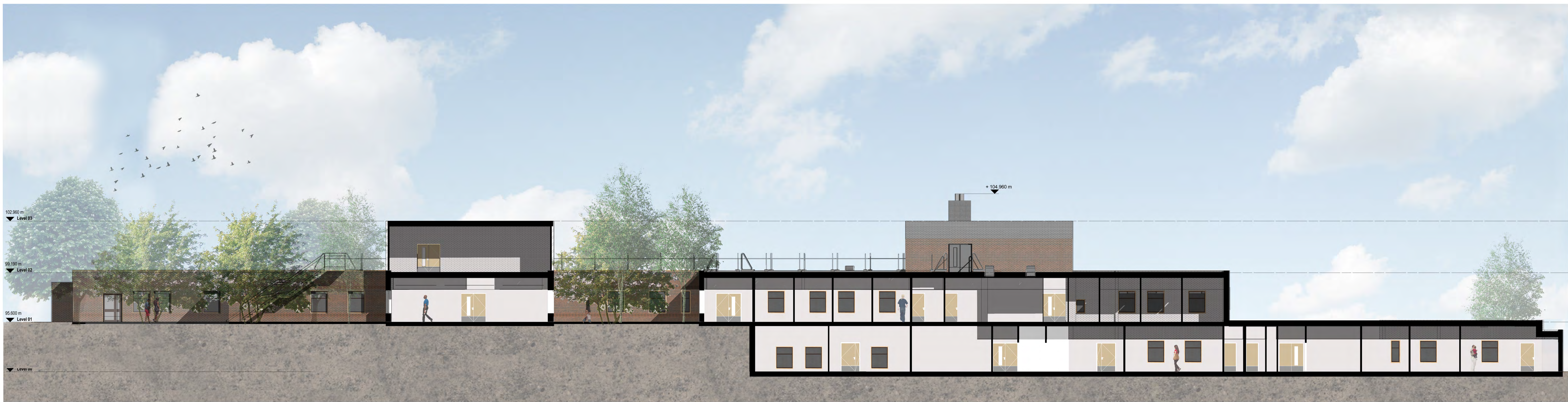
Section 1 - Long Section