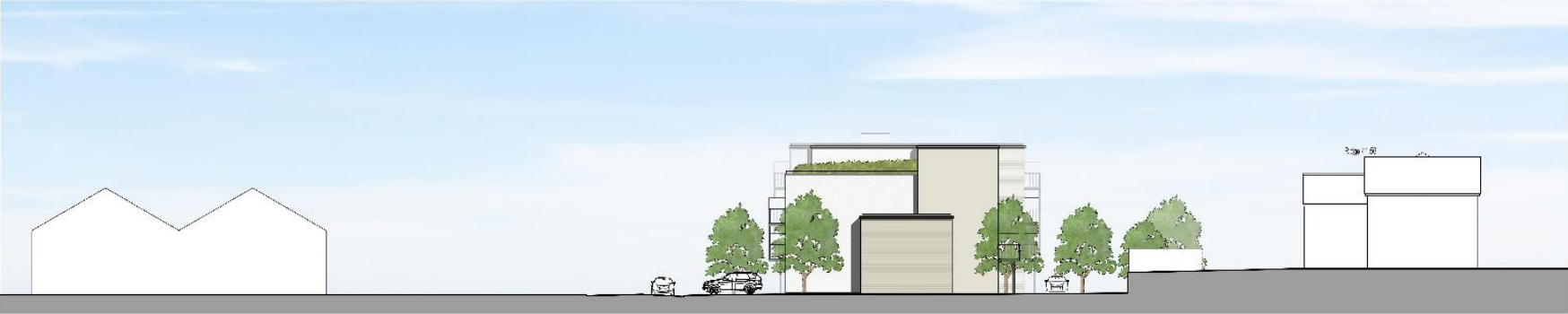
Street Scene Along Boyn Valley Road