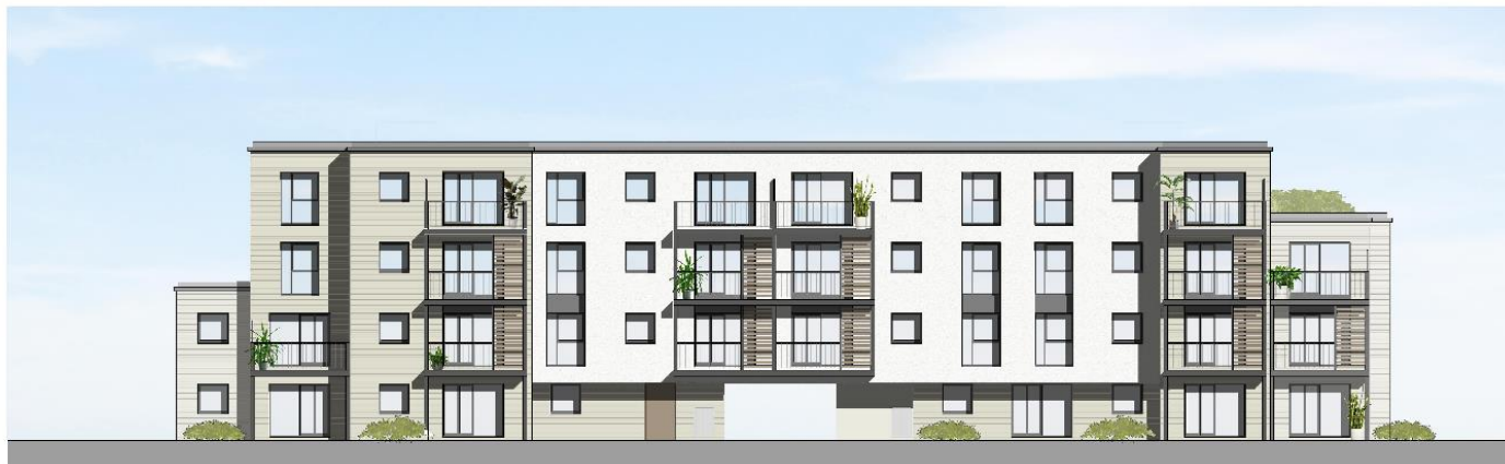
Rear (North) Elevation