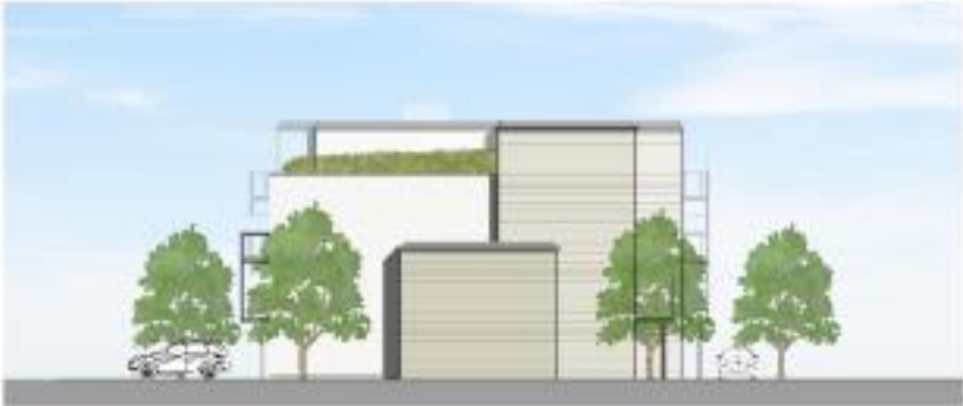
Side (East) Elevation