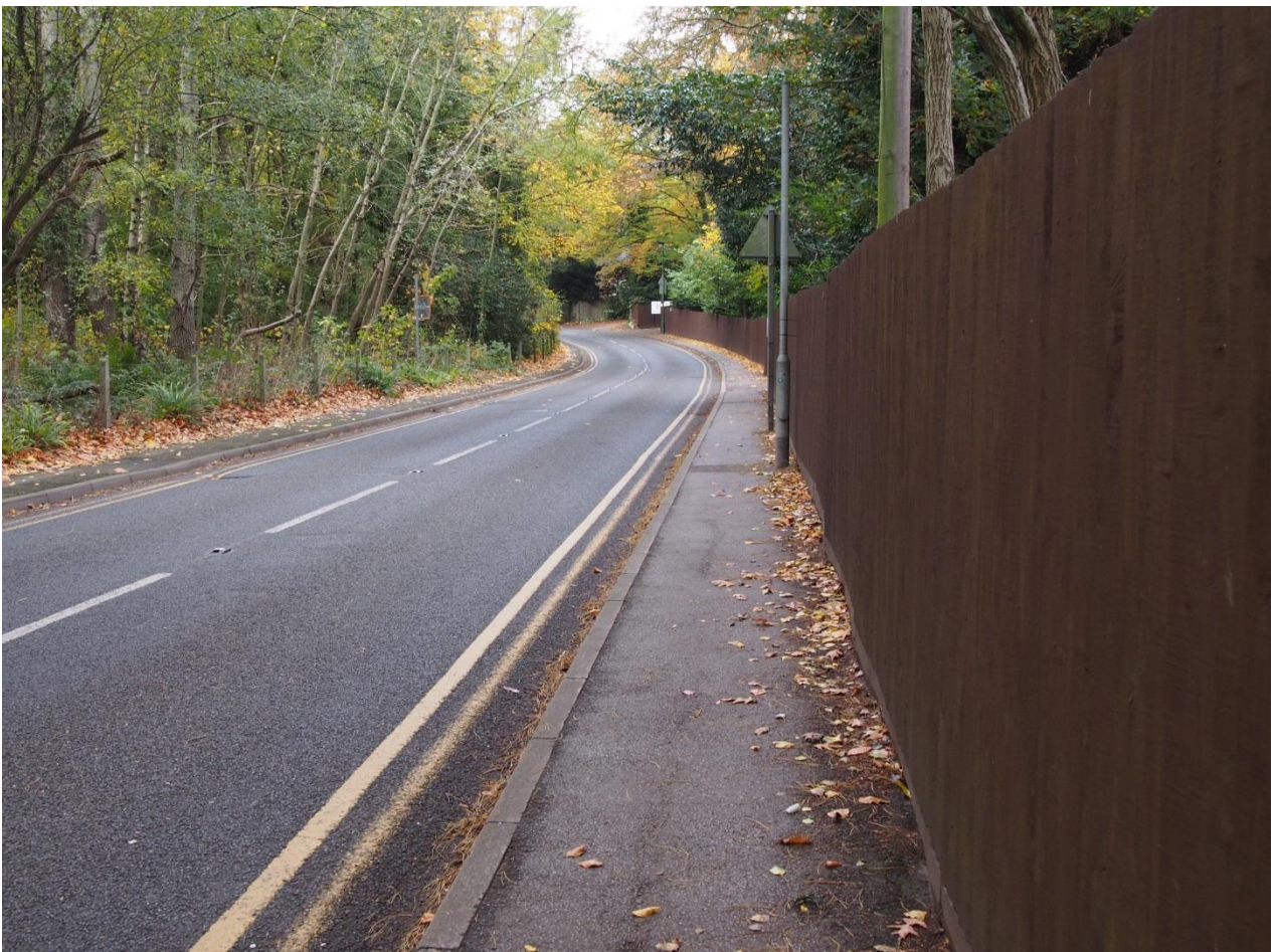
Figure A2.4 – Devenish Road Outside Heathermount School