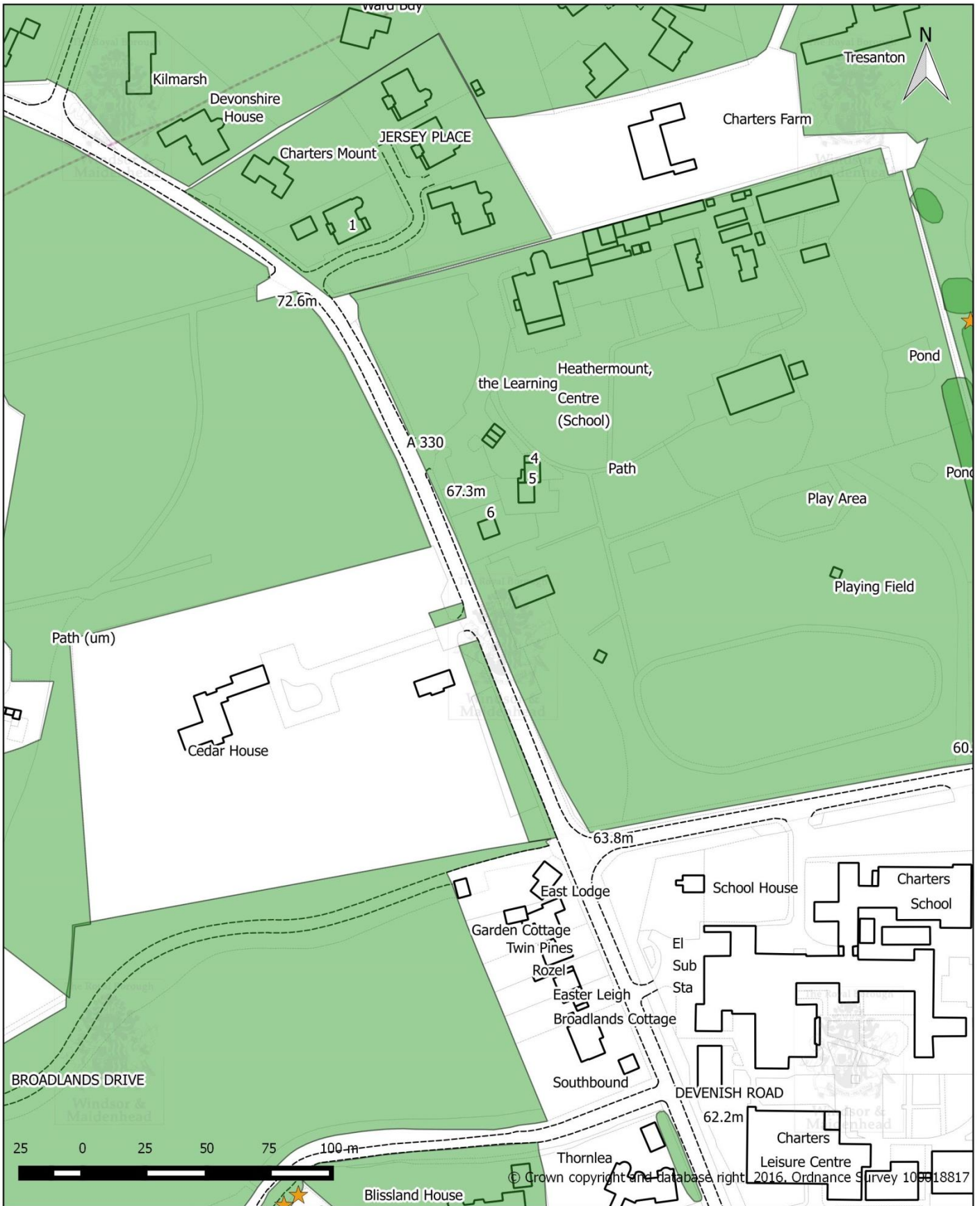
Map of Tree preservation Orders on Devenish Road Near Charters School