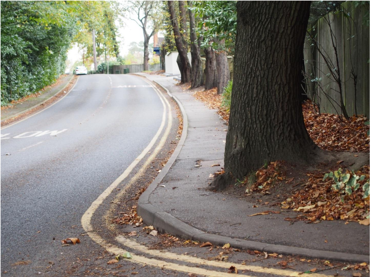
Figure A2.5 – Pinch Point Caused by Mature Oak Tree at Jersey Place