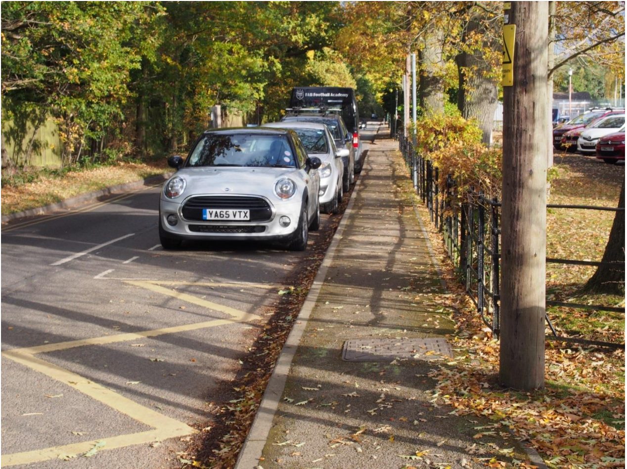
Figure A2.3 – Charters Road