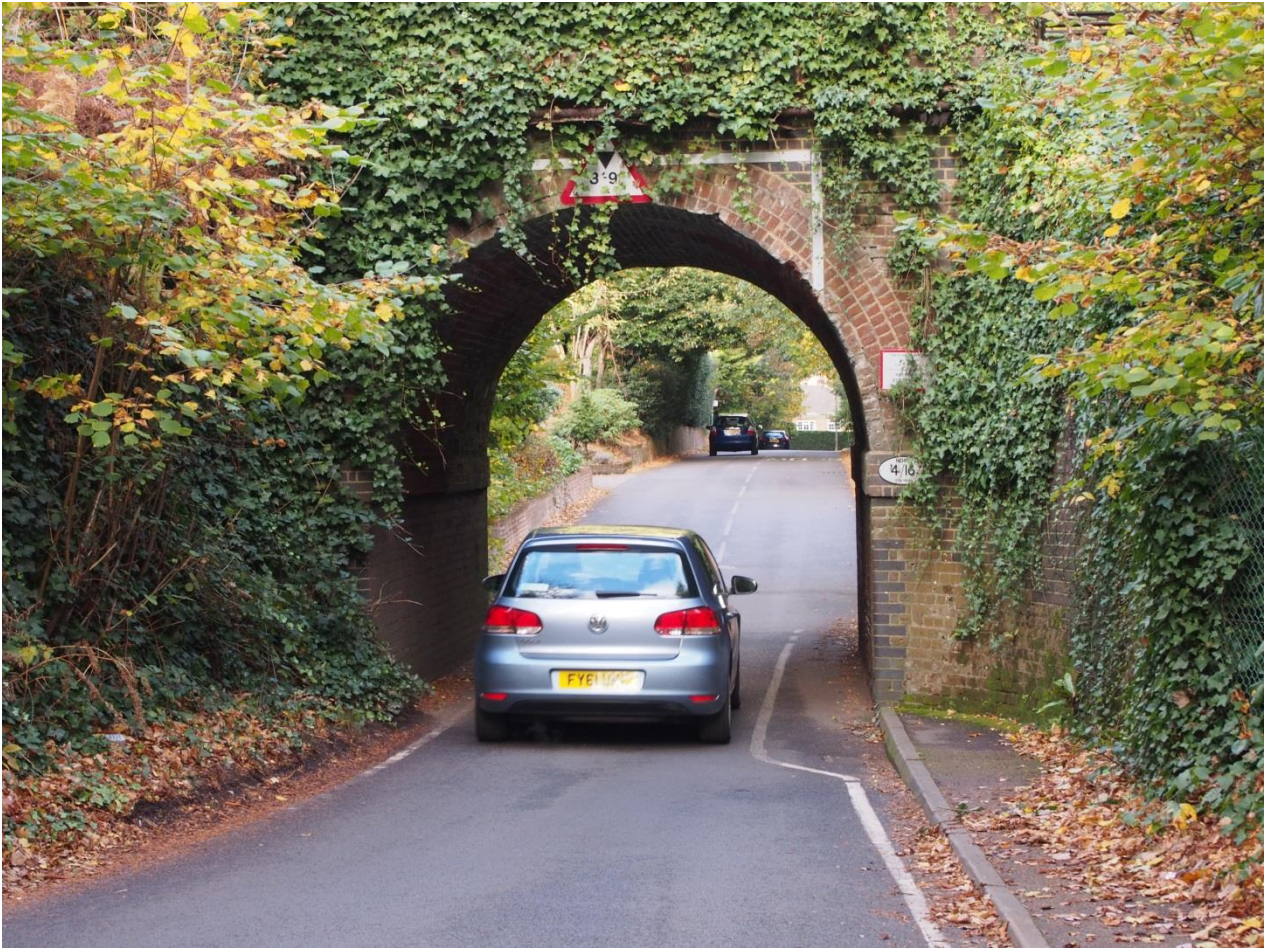
Figure A2.1 – Discontinuous Pedestrian Route at Dry Arch Road Rail Bridge