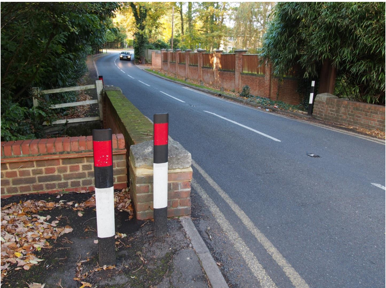
Figure A2.2 – Proposed Location of New Footway at Elm Park