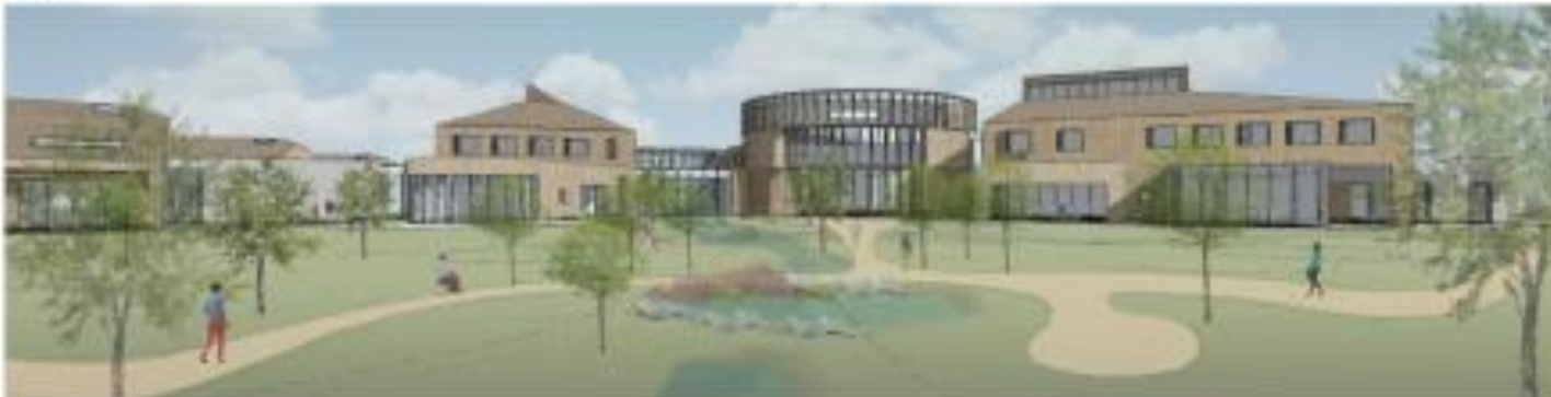
3D VIEW 2