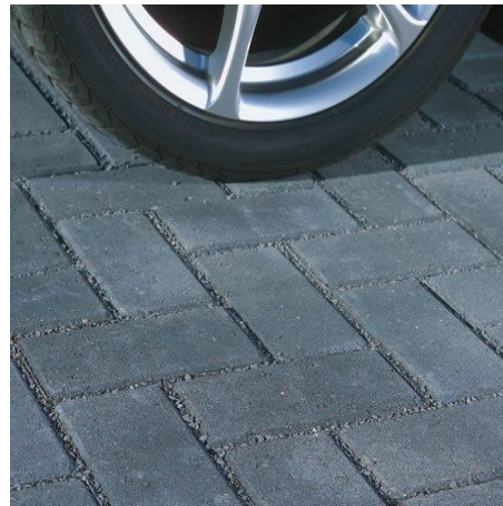
Permeable block paving to car parking bays