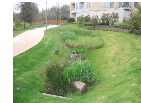
Swale planting — help with the removal of contaminant and assist in increased filtration