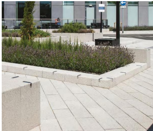
Textured wide top kerb to form planters