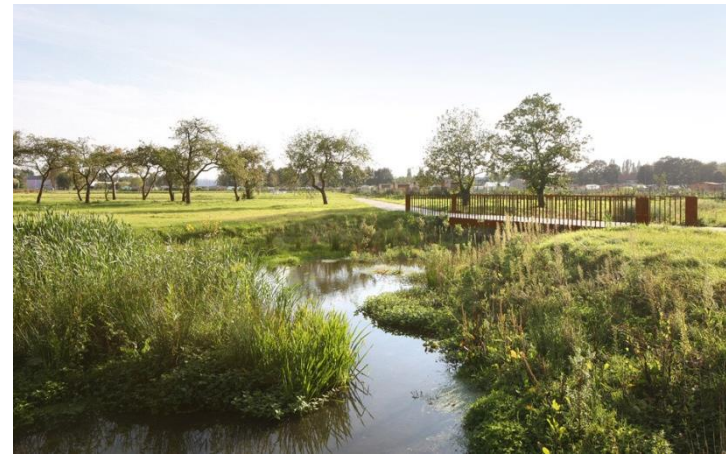
The centre landscape blends in the natural landscape of the site with swales for water attenuation creating valuable wildlife habitat