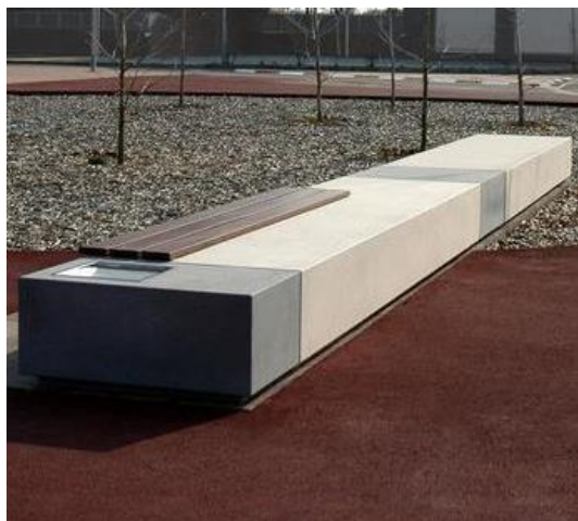
Concrete benches in the feature landscape area