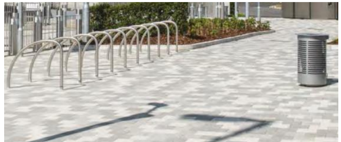
Provision for a street furniture , bollards , bins , external lighting and cycle racks