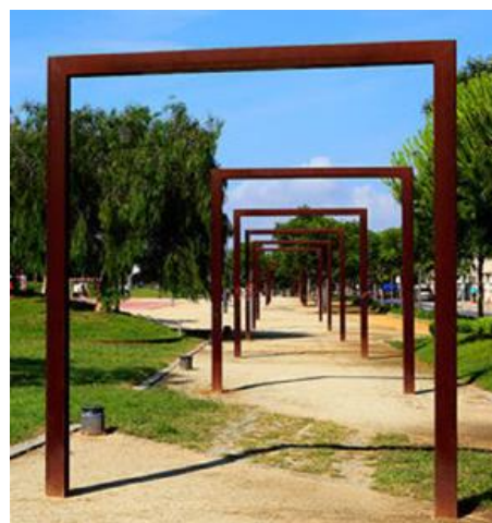
Provision for a pergola leading up to the centre