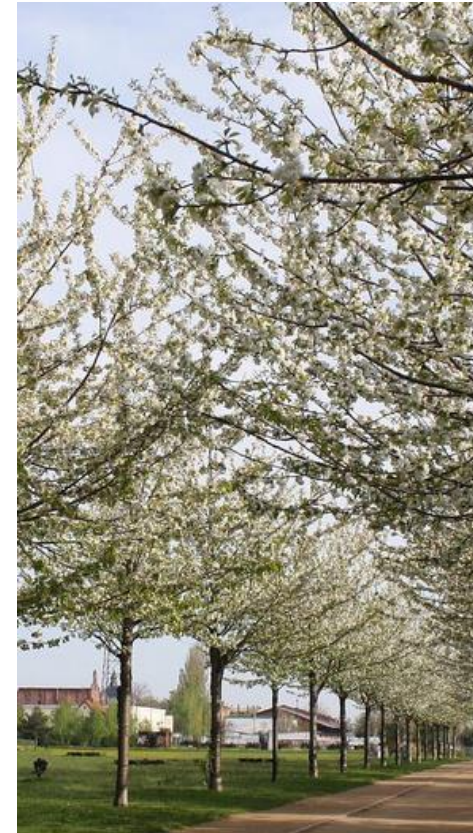
Prunus avium plena