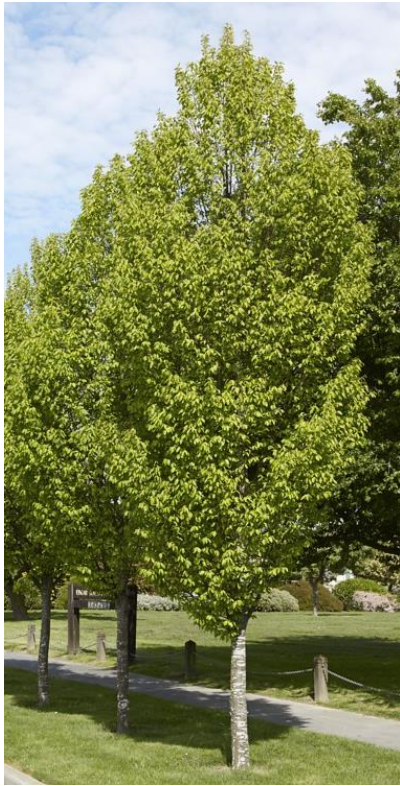
Carpinus betulus 'frans fontaine'