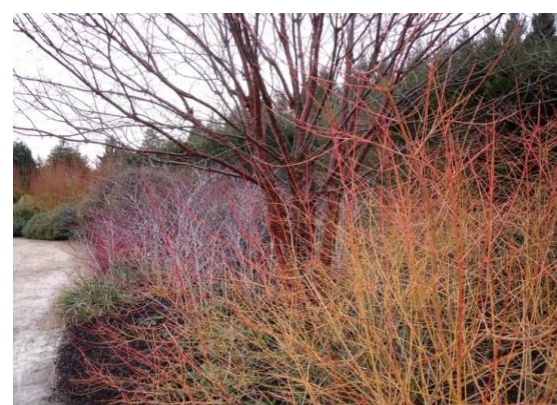
Boundary screen planting – native hedge mix, seasonal colour, low maintenance