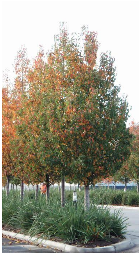
Pyrus calaryana chanticleer