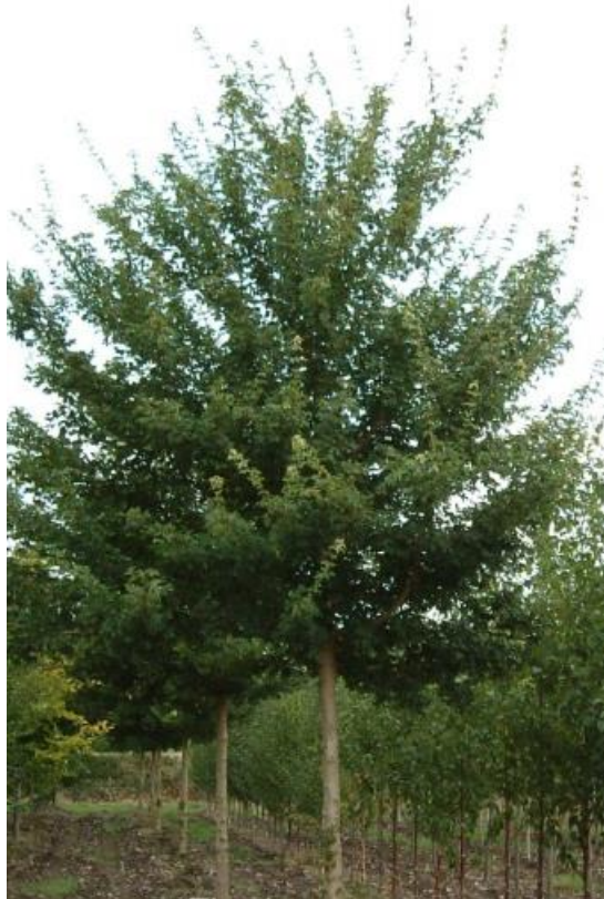
Acer campestre elsrijk