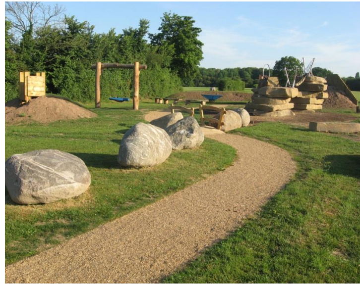
Natural play to blend in the greater landscape