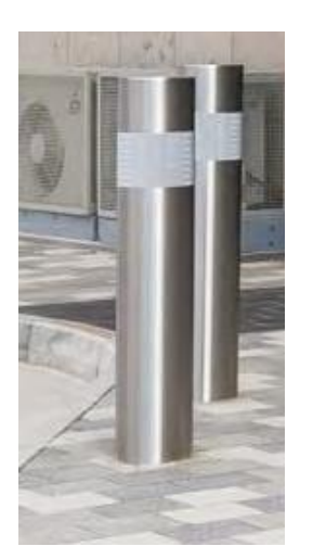
Provision for a street furniture, bollards, bins, external lighting and cycle racks