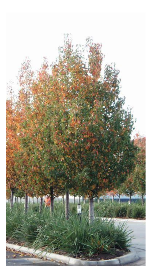
Pyrus calaryana chanticleer