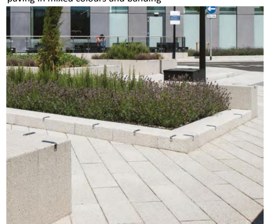
Textured wide top kerb to form planters