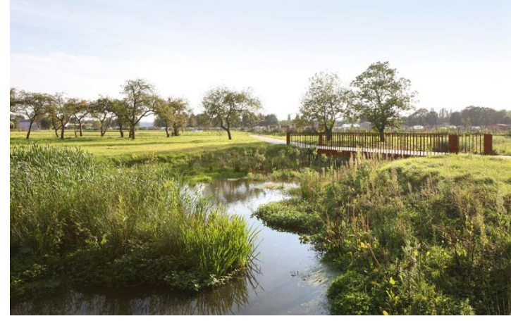
The centre landscape blends in the natural landscape of the site with swales for water attenuation creating valuable wildlife habitat