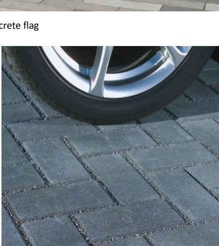
Permeable block paving to car parking bays