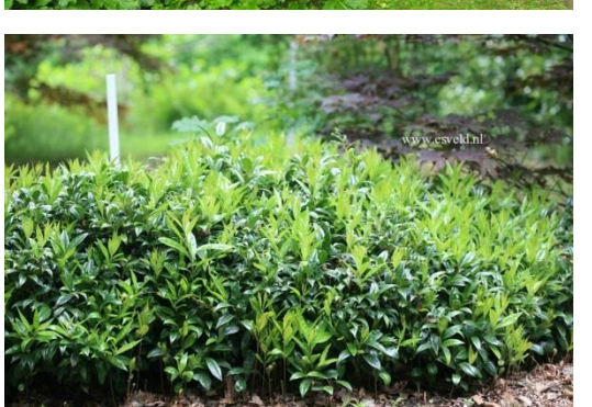
Car Park Planting—robust, easy maintenance