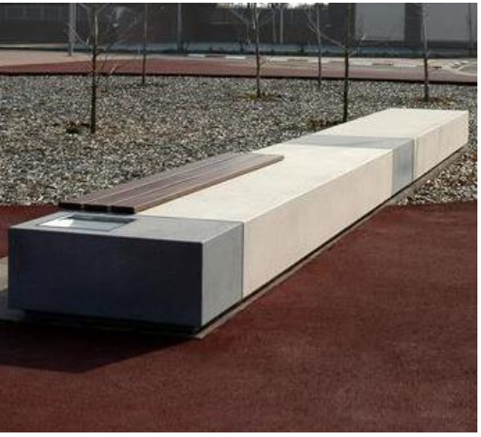
Concrete benches in the feature landscape area