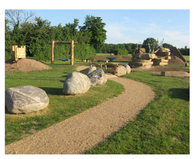
Natural play to blend in the greater landscape