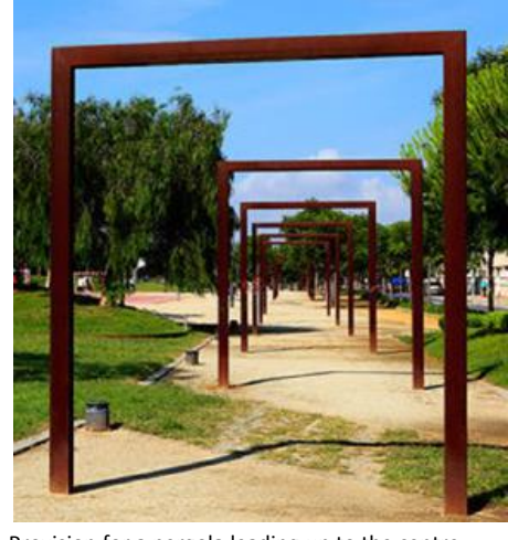
Provision for a pergola leading up to the centre