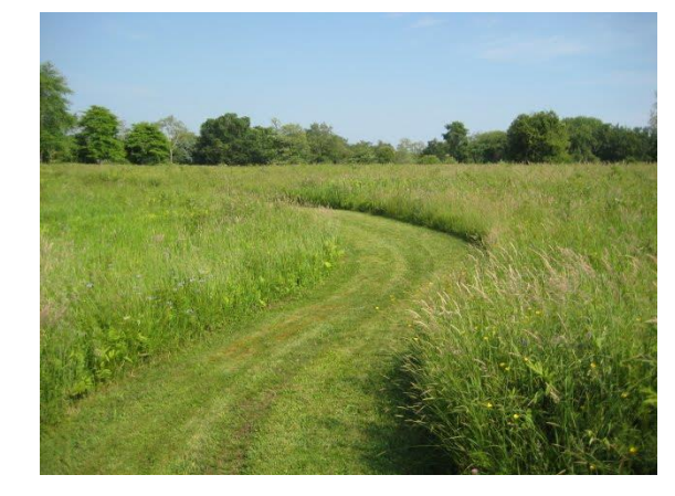
Planting cycle / pedestrian routes – seasonal colour , native species to improve wildlife habitat