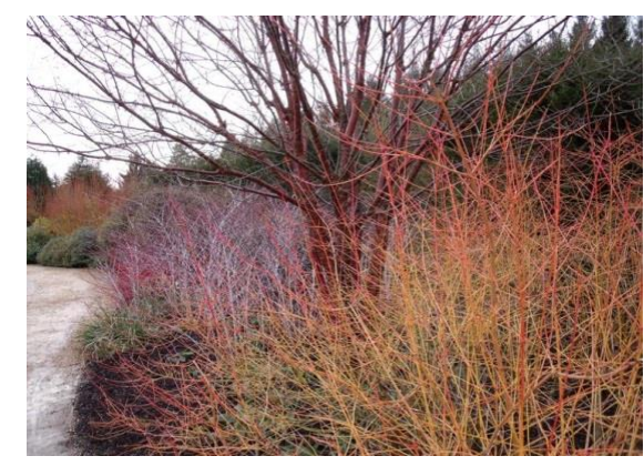
Boundary screen planting – native hedge mix, seasonal colour, low maintenance