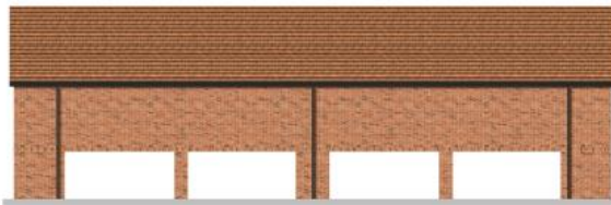
Rear Elevation 1: 100