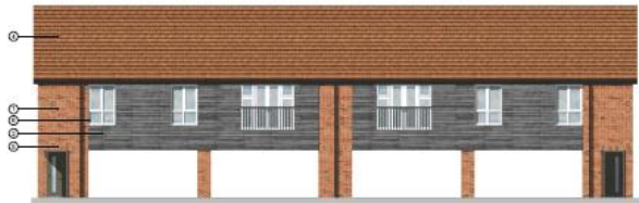
Front Elevation 1: 100