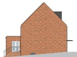
Left Side Elevation 1:100