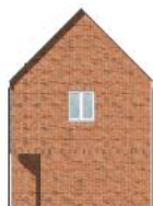
Right Side Elevation 1: 100