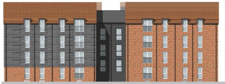
Left Side Elevation 1:100