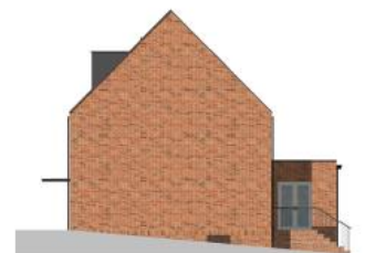
Right Side Elevation 1:100