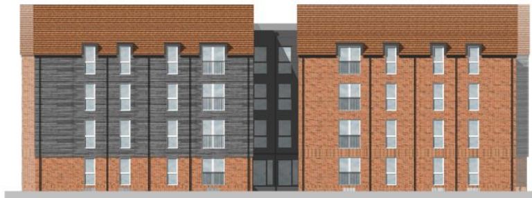
Right Side Elevation 1:100