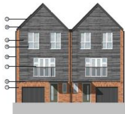
Front Elevation 1:100