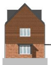
Left Side Elevation 1:100