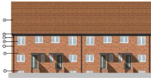
Front Elevation 1: 100