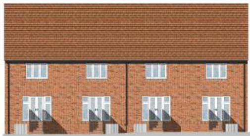
Rear Elevation 1: 100