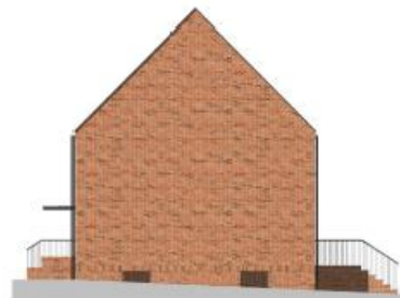
Right Side Elevation 1: 100