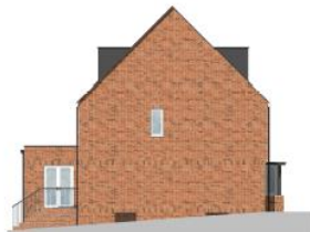
Left Side Elevation 1:100