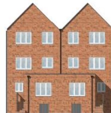
Rear Elevation 1:100