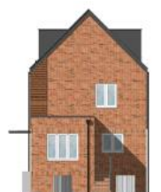
Right Side Elevation 1:100