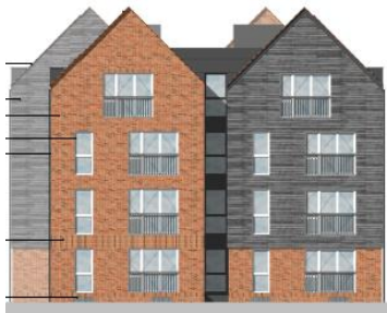
Front Elevation 1:100