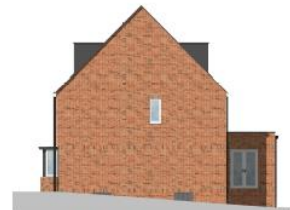
Right Side Elevation 1:100