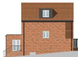
Rear Elevation 1:100