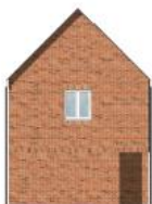
Left Side Elevation 1: 100