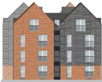
Rear Elevation 1:100