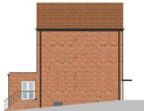
Left Side Elevation 1:100