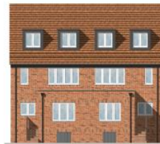
Rear Elevation 1:100