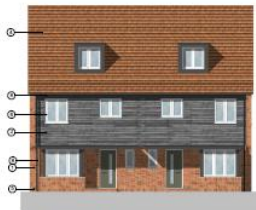
Front Elevation 1:100