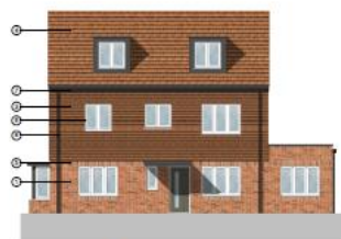
Front Elevation 1:100