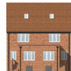
Rear Elevation 1:100