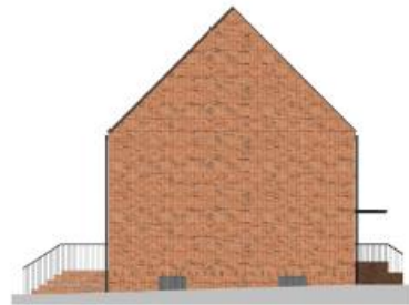
Left Side Elevation 1: 100