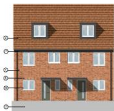
Front Elevation 1:100