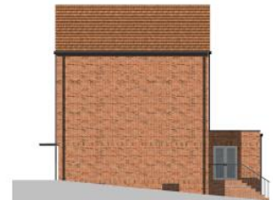
Right Side Elevation 1:100