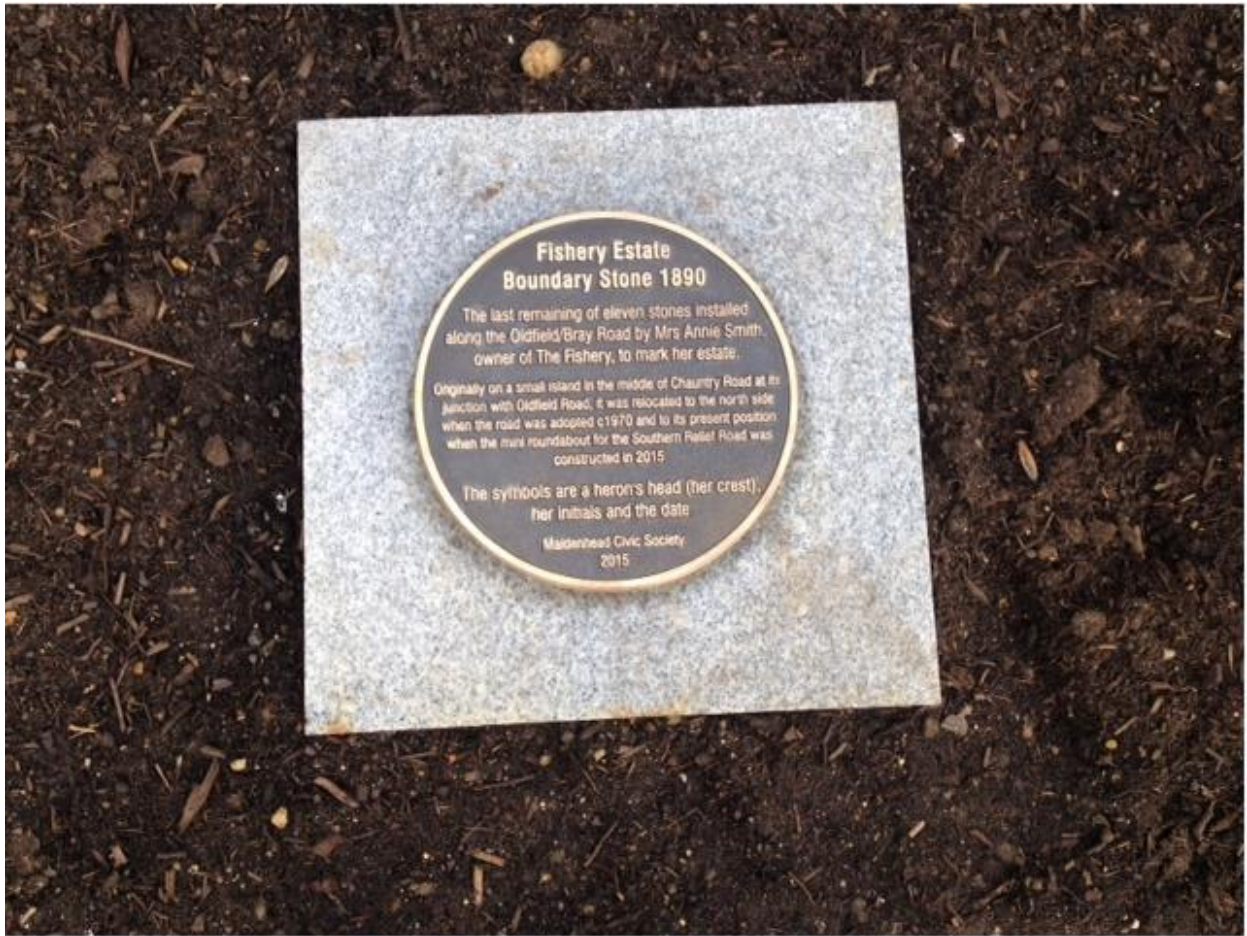
Sample Plaque to be installed