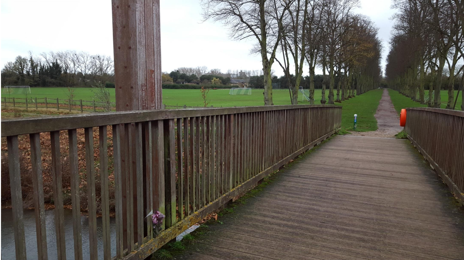
Looking from the Footbridge