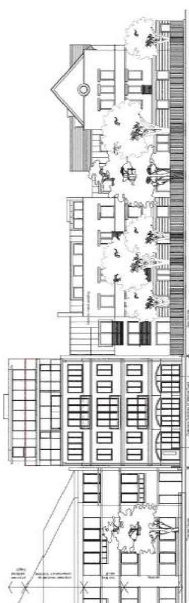
PROPOSED FRONT ELEVATION (east)