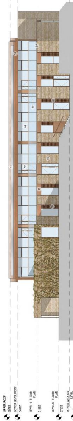
1 GA SOUTH ELEVATION 1:100