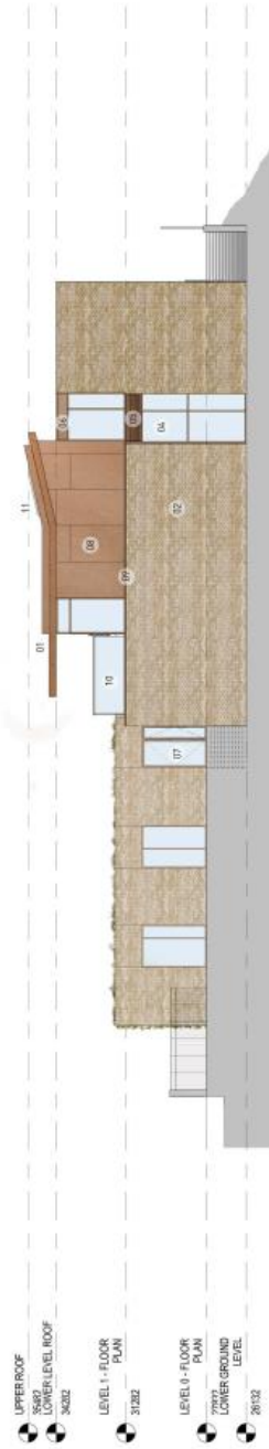
1 GA EAST ELEVATION 1:100