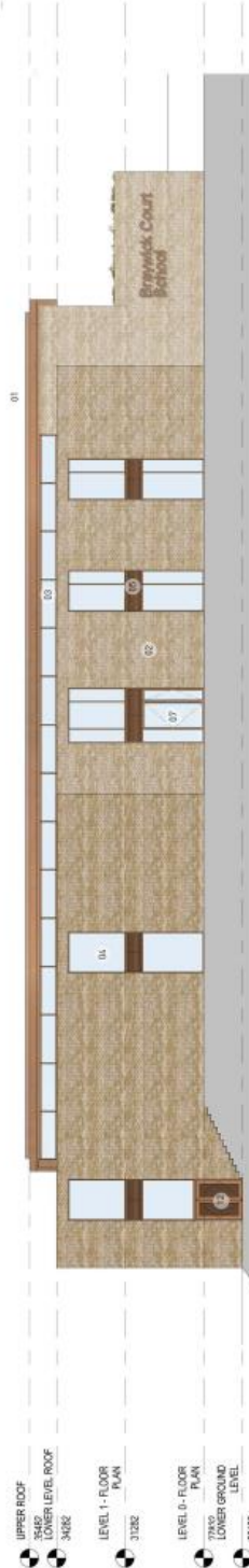
2 GA NORTH ELEVATION 1:100