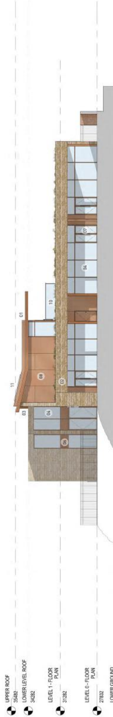
2 GA WEST ELEVATION 1:100

SCALE IN METRES 0 1 2 3 4 5 SECTION TITLE: GA SOUTH ELEVATION SCALE: 1:100 DATE: 10/10/2018 BY: J. B. P.