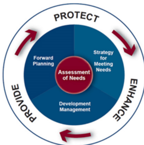
Figure 1: Sport England themes

To provide new playing pitches where there is current or future demand to do so